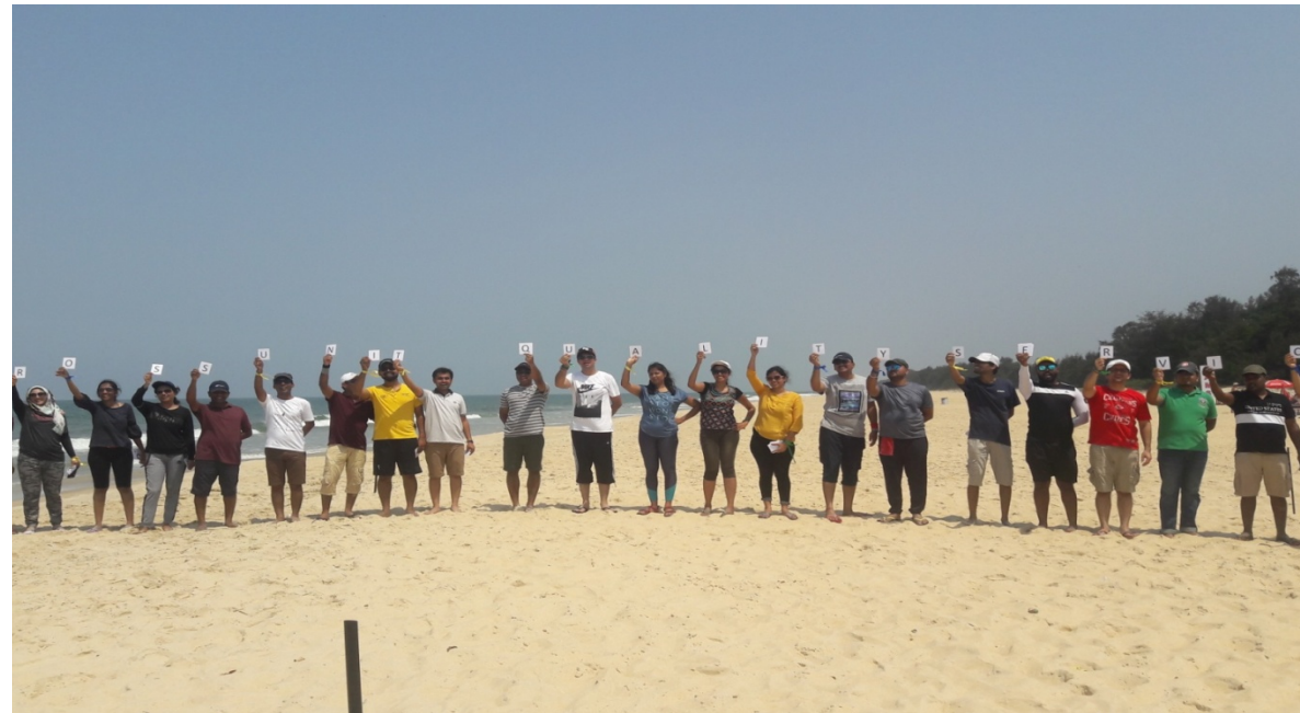
WHOSE LINE IS IT ANYWAY?