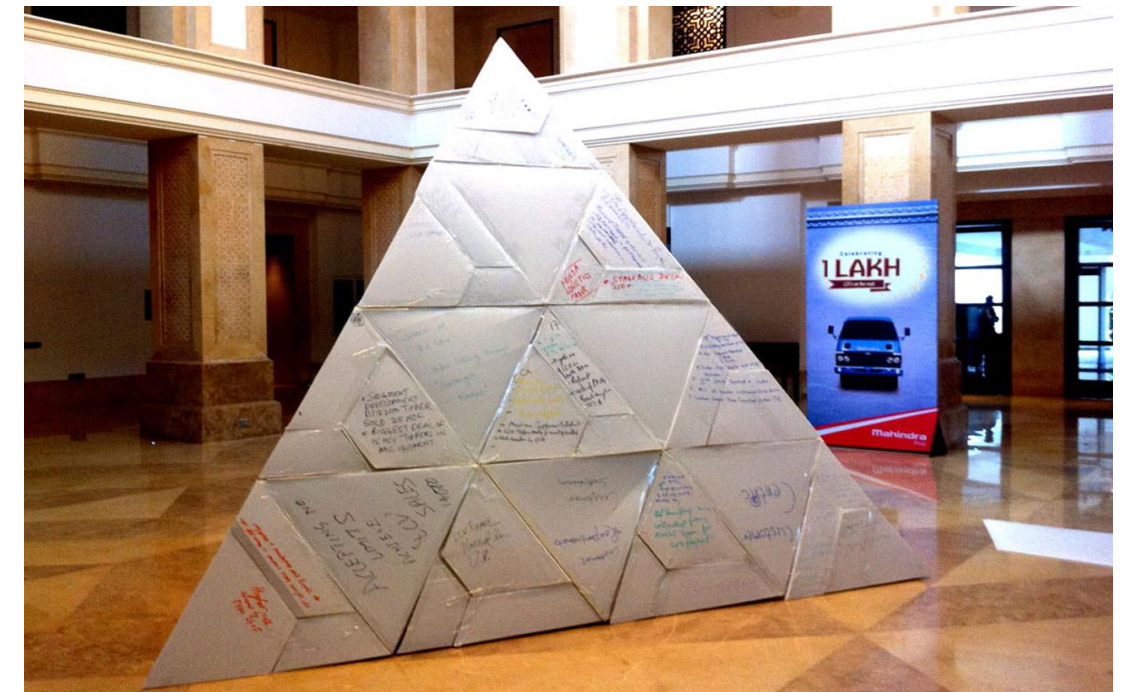
PYRAMID VISION BOARD