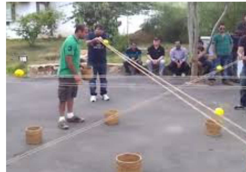
BASKET THE BALL