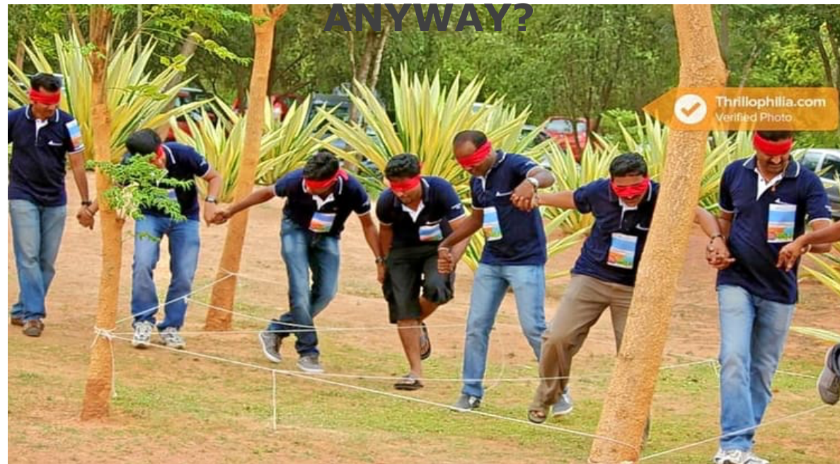
BLIND MAN BUFF