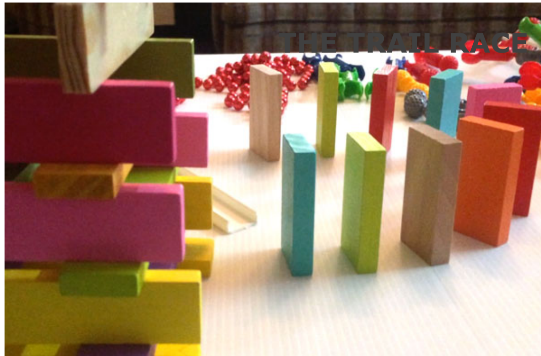
DOWNING THE DOMINOES