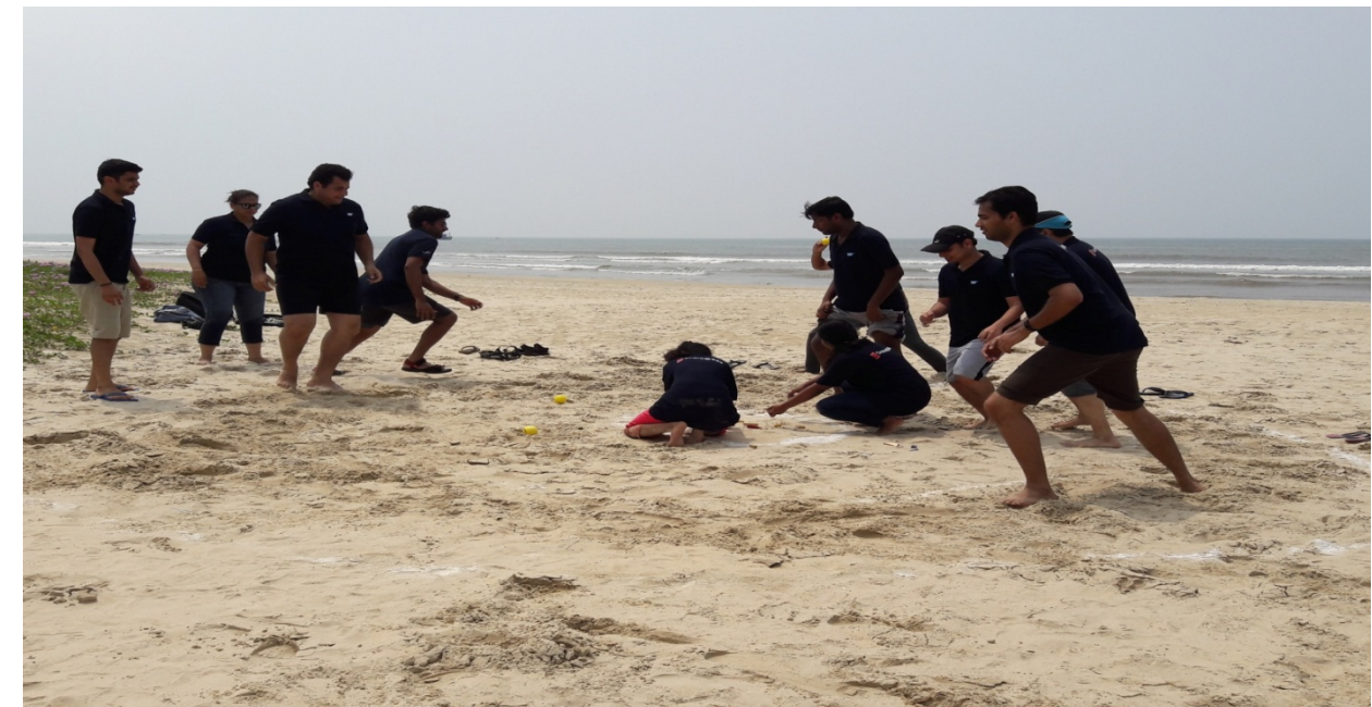
BIG BEN ATTACK