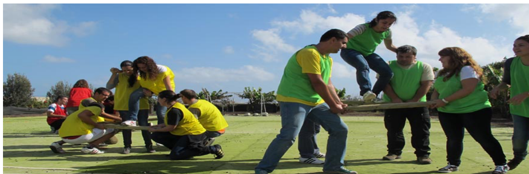
CARRY THE SOLDIER