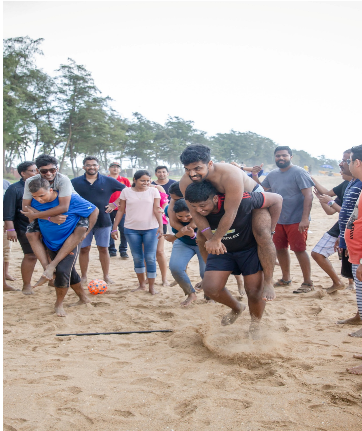
CARRY THE HEAVIEST