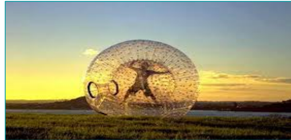
LAND & AQUA ZORBING