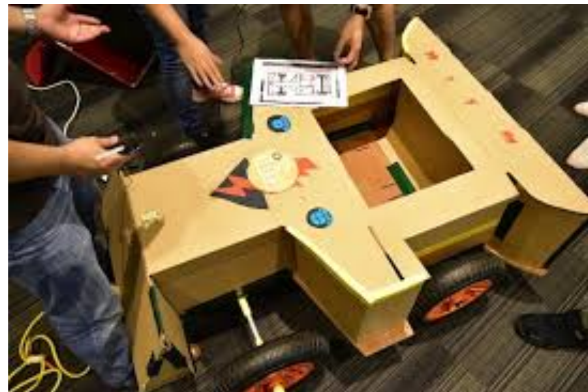
FORMULA 1 - VROOM!